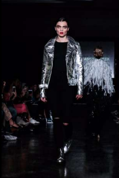
VEGAN FASHION SHOW LOS ANGELES