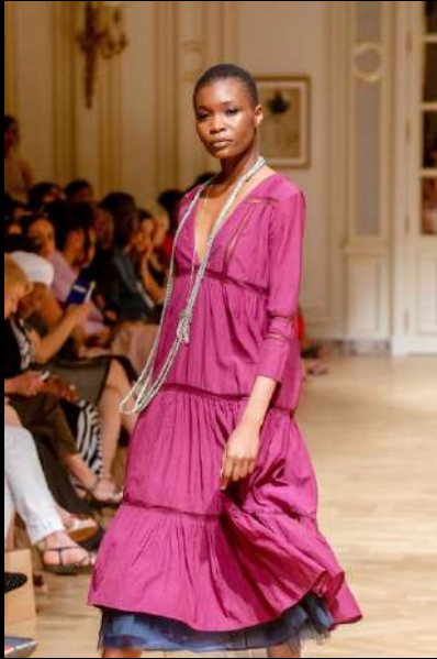
LE RITZ PARIS