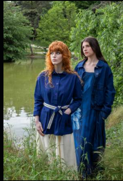
LOANE DRESS & LUCIE JACKET LEA DRESS & HAILEY JACKET