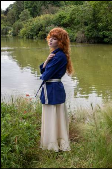
LOANE DRESS & LUCIE JACKET